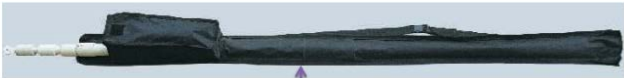
Telescopic extendable fiber glass rod with carrying bag